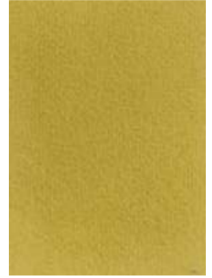
VELVETO | 917