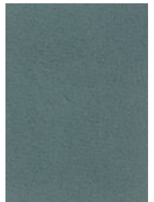
VELVETO | 962