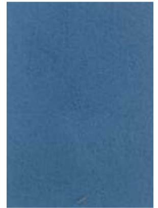
VELVETO | 971