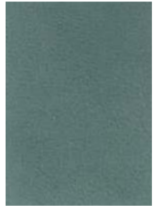
VELVETO | 963