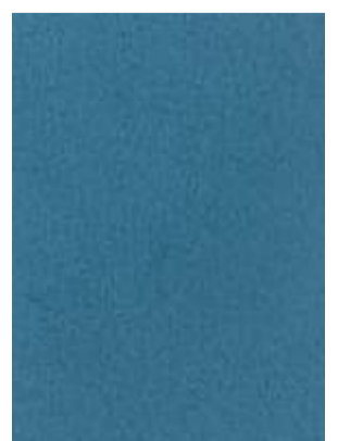
VELVETO | 970