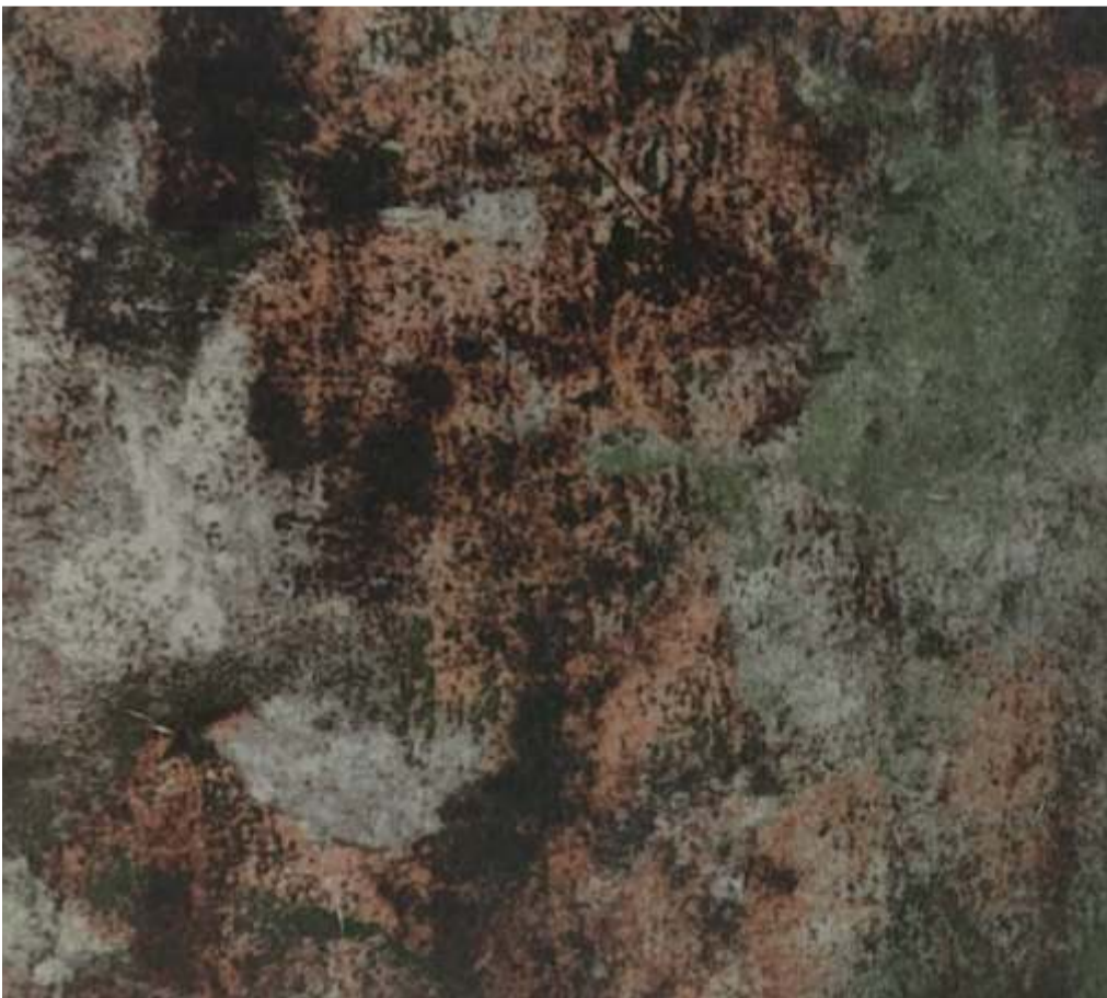
HALDEN | 915