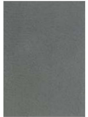
VELVETO | 944