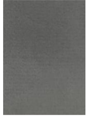
VELVETO | 941