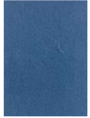
VELVETO | 971