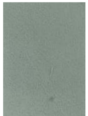
VELVETO | 953