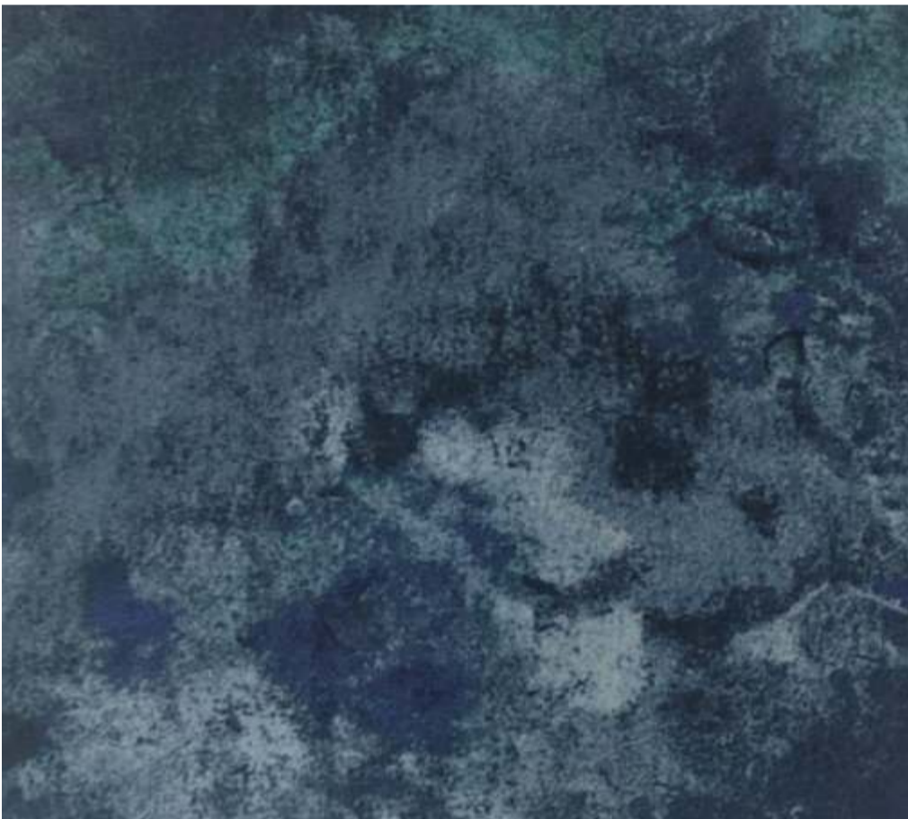
HALDEN | 917