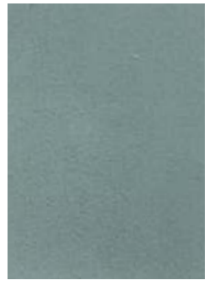
VELVETO | 964