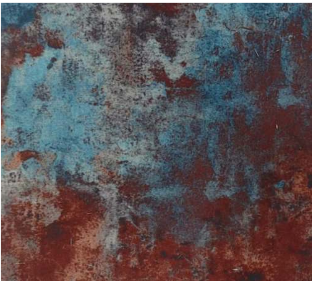
HALDEN | 918