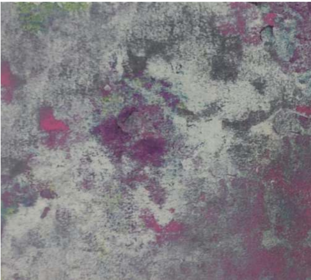
HALDEN | 921