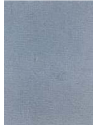
VELVETO | 968