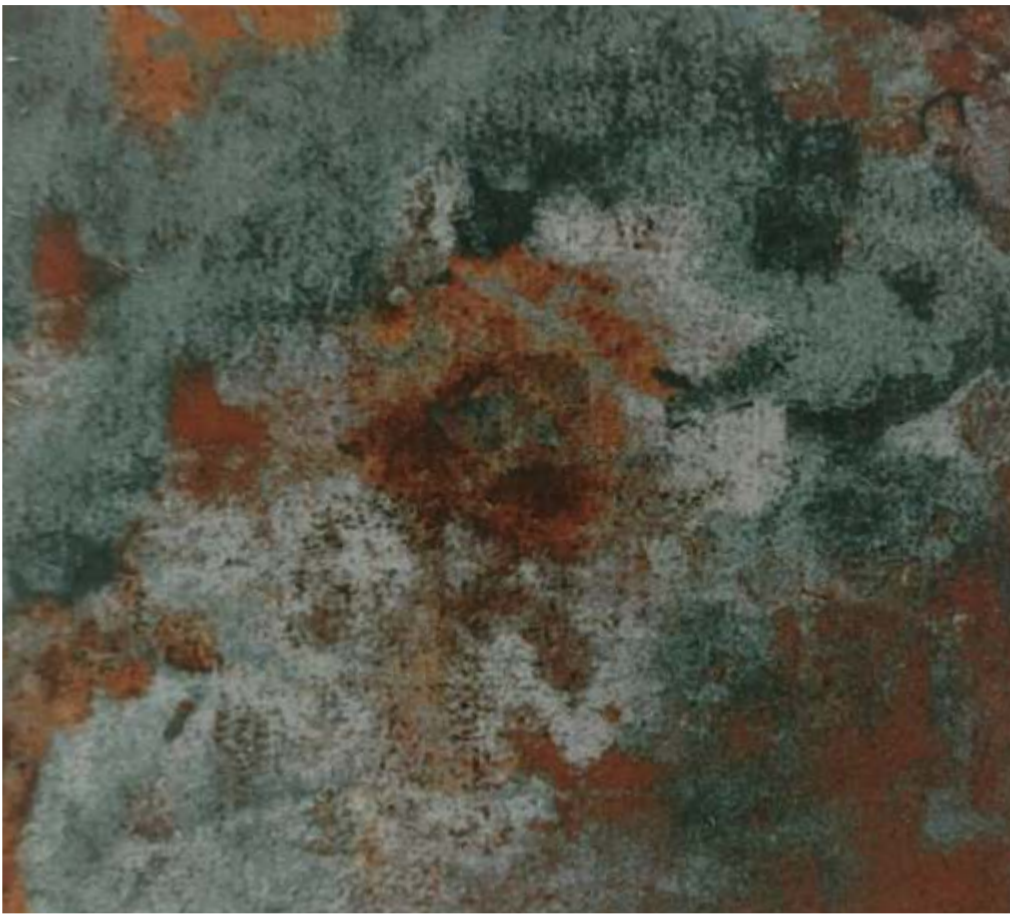
HALDEN | 916