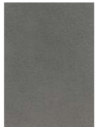
VELVETO | 945