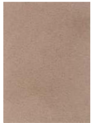
VELVETO | 913