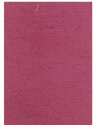
VELVETO | 923