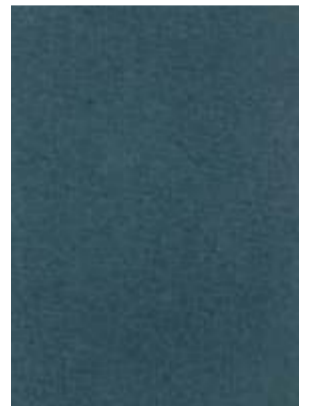
VELVETO | 961