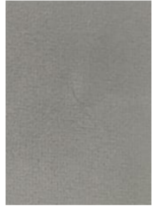
VELVETO | 946