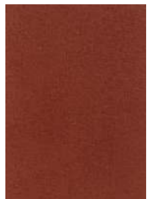
VELVETO | 928