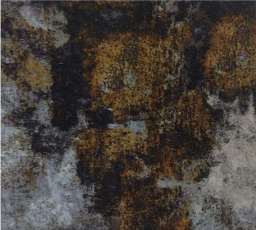
HALDEN | 914