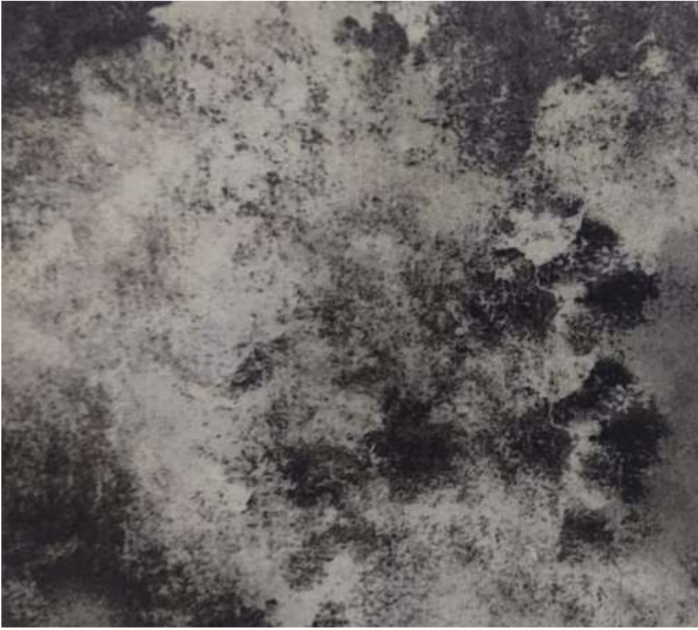
HALDEN | 913