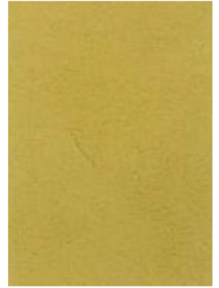
VELVETO | 917